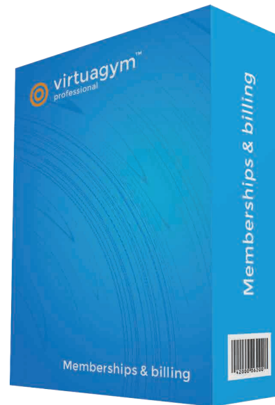
Membership & Billing