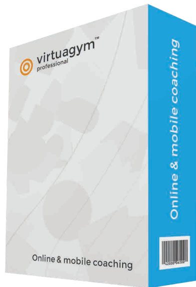
Coaching & apps

Select the best software package for your business